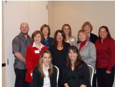
Dental Hygiene Examiners